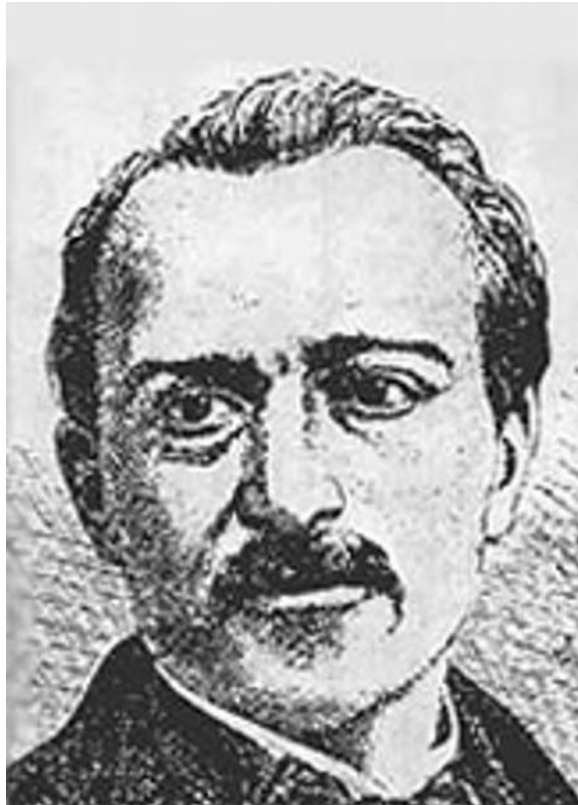
Jean Joseph Etienne Lenoir (1822-1900)

Nevertheless, Scientific American advised in September 1860, that the Parisian newspaper Cosmos had pronounced the steam age over! By 1865, 143 had Lenoir gas engines had been sold in Paris alone, and production by Reading Gas Works in London had begun.