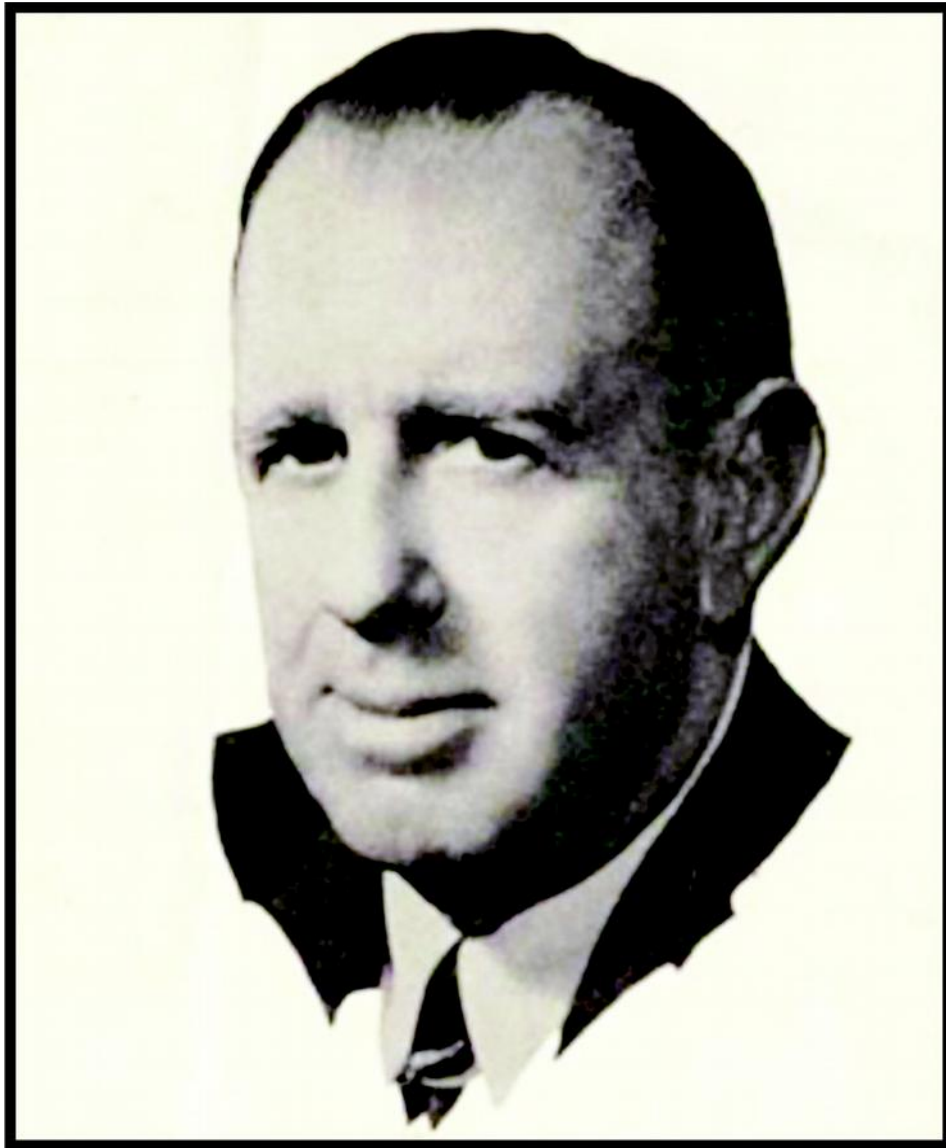
Powel Crosley Jr., September 18, 1886 – March 28, 1961

Mr Crosley was 74 when he died of a heart attack. Crosley liked to label himself "the man with 50 jobs in 50 years," a catchy sobriquet that was far from true, although he did have more than a dozen jobs before he got into automobile accessories. He helped quite a few inventors up the ladder of success by buying the rights to their inventions and sharing in the profits. His work provided employment and products for millions of people.