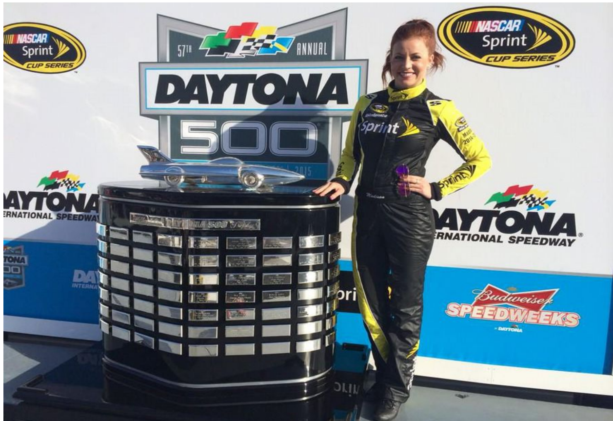
The Harley J. Earl Trophy with a cute Sprint Girl.

Great steel shops, garages, barns, and homes for the Do It Yourselfer! Call for a free quote. West & East Coast Factories.